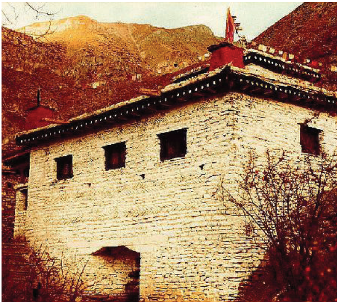
The "Temple Of Miraculous Fire" at Muktinath, Nepal. Photo by Ken Street (Nov. 1979).

[For more on this subject, please read our tract The Temple Of Miraculous Fire .]